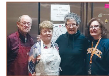
Farragut Presbyterian Church has been preparing lunch for our neighbors in the VMC Resource Center for over 25 years. VMC is grateful to our volunteer meal groups who cook and serve delicious meals for our neighbors working to achieve housing.