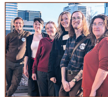
VMC staff along with members of the Knoxville-Knox County Homeless Coalition attended this year's Day on the Hill for Housing and Homelessness in Nashville.