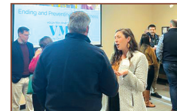
VMC hosted its first Faith Leadership Breakfast of 2024 to connect and build partnerships within the Knoxville faith community.