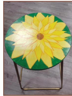
Another furniture piece displaying Leo's Art

colorful masterpieces on the apartment wall to bright and creative designs on furniture, Leo can see the world from a very different perspective.