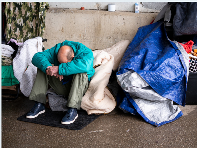
Our neighbors experiencing homelessness deserve housing rather than living in these conditions.