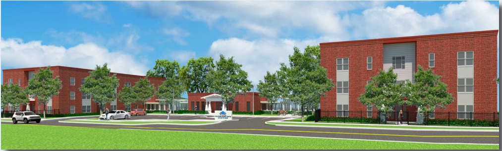
Rendering of Caswell Manor facility.

The transformation of 1501 E. Fifth Ave. began in 2021, continued through 2022, and will be open and ready for occupancy in 2023. After a few delays due to supply chain issues, Caswell Manor is close to completion. The campus consists of two wings with 24 one-bedroom apartments connected by a center building for community space, dining, laundry, and support staff offices. Caswell Manor will provide 48 more units of permanent supportive housing with on-site case management for individuals experiencing chronic homelessness.