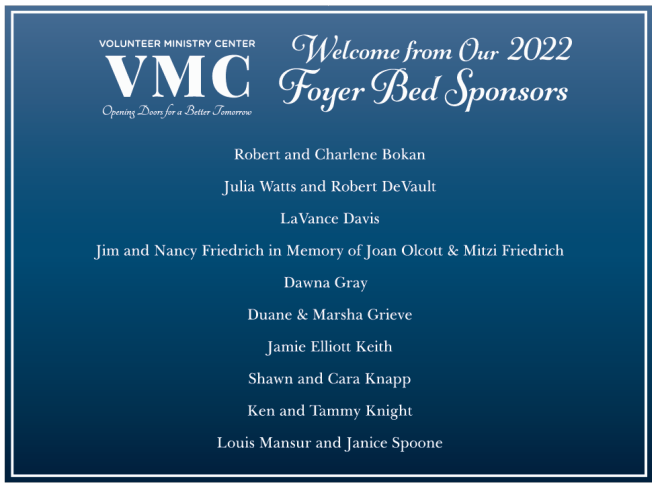
This placard is on the Welcome Wall of the Foyer. The support from the Foyer Bed Sponsors assures shelter and safety for the most vulnerable of our homeless neighbors.