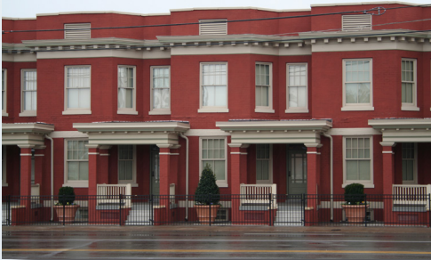
Minvilla Manor is home for 57 individuals who were formerly living on the streets of Knoxville.

69 residents lived in Minvilla Manor in 2022.