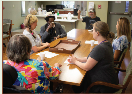
Occupational Therapy students from Roane State Community College provide life skills training to residents of Minvilla Manor.