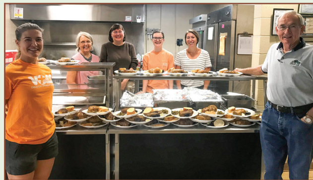
Laurel Church of Christ has provided delicious meals at VMC for over 25 years.