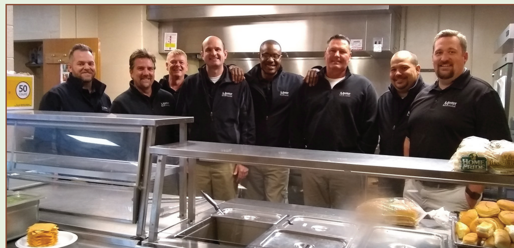
The staff of Master Dry regularly cook up a great meal for VMC Resource Center members.