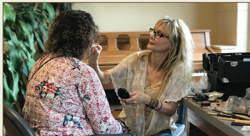
The Women's Mentoring Group from Church of the Good Samaritan hosts Spa Night twice a year providing hair styles, make-up, and manicures for the ladies in VMC's programs.