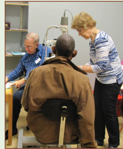
Remote Area Medial provides vision exams and glasses on a monthly basis at VMC.