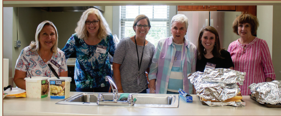
Members of Cedar Springs Presbyterian Church hosted a cook-out at Minvilla Manor.