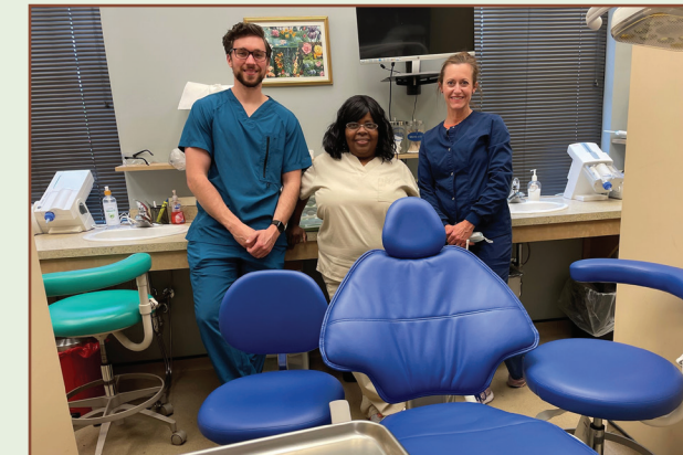
The Smile 180 Foundation and Delta Dental awarded the VMC Dental Clinic a grant for a new dental patient chair and dentist and assistant chairs.