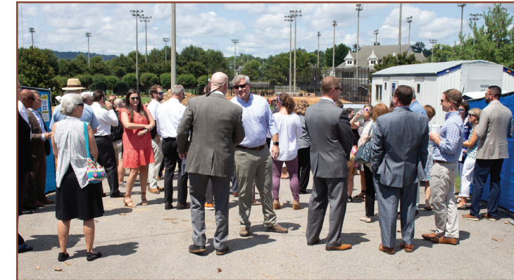
Groundbreaking attendees celebrated the event commencing the addition of 48 permanent supportive housing homes

It was the convergence of these two events that became the catalyst for the transformation at 1501 E. Fifth Avenue. With the major work of underwriting the project accomplished, the transformation of 1501 E. Fifth Avenue has physically begun. Purchased in August 2020, the old Positively Living (aka Parkridge Harbor Apartments) has been demolished. Built in 1965 as an office building, through the years it became an emergency shelter for families and then most recently a