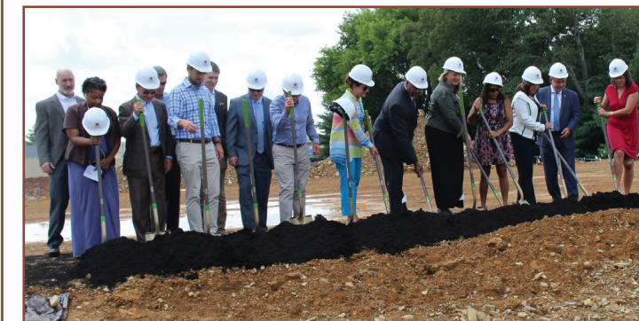
City and County Officials and Financial Partners break ground for the new Caswell Manor development.