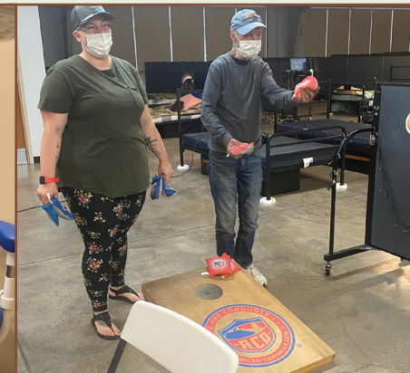
VMC staff at the Foyer encourage socializing and healthy activities for those receiving overnight shelter services.