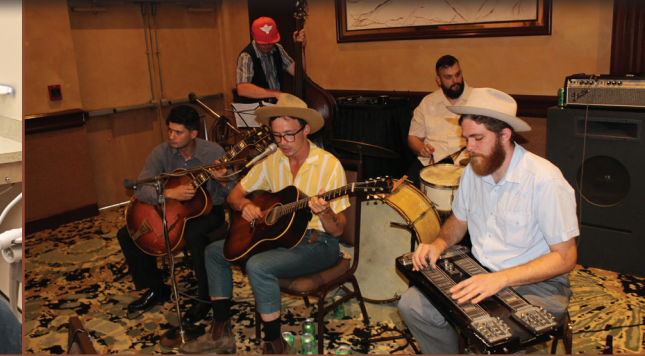
A crowd of 250 guests at this year's Don Sproles Memorial Evening: Wine and Shine Event on July 16th at the Crowne Plaza Knoxville were entertained by the lively music from The Tennessee Stifflegs.