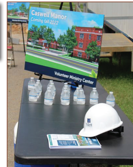
Renderings of the Caswell Manor development were displayed at the Groundbreaking on August 18th.

attending the community's “Homeless Memorial Service” held annually at St. John's Lutheran Church. Such services are observed throughout the country sometime around the 20th of December to coincide with the longest night of the year. The service is a memorial for those who died during the year while experiencing homelessness. Each name is read aloud followed by the ringing of a single hand bell.